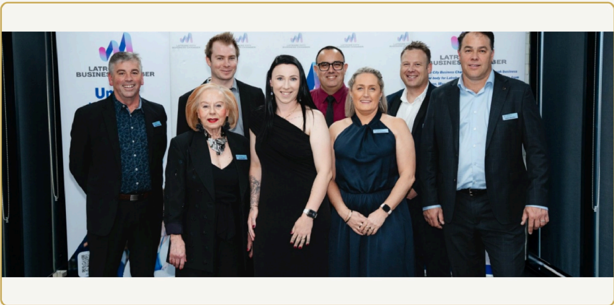
People's Choice Awards · Latrobe City Business Chamber · 2026